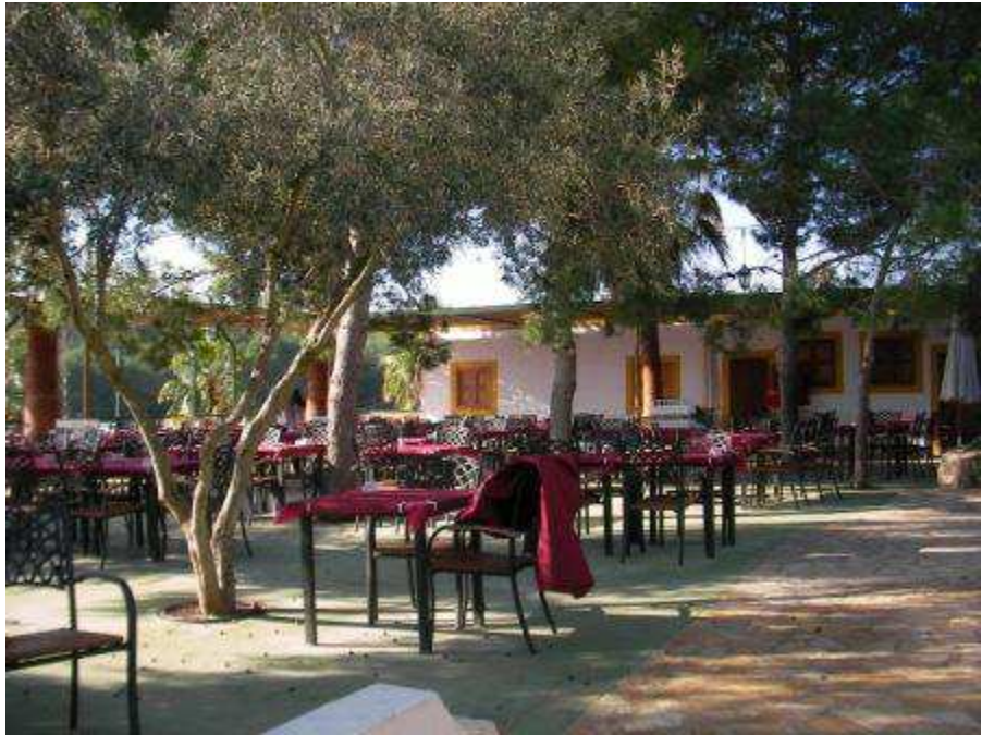
The restaurant outside Terrace.

There is an abundance of views from the outside terraces which make lovely pictures on your wedding day.