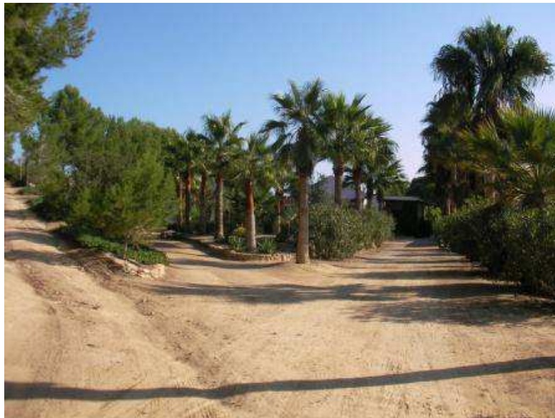
Driveway Leading to the Venue.

As you walk up the driveway towards the venue you can only imagine what's beyond the door. As you walk up you are surrounded by palm trees.